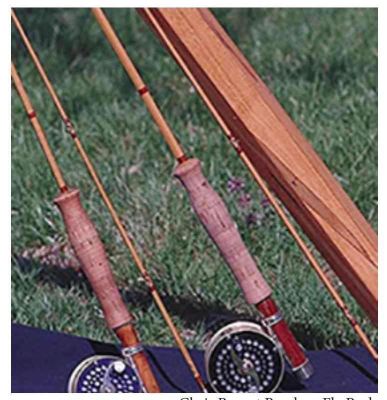
Chris Bogart Bamboo Fly Rods

You don't need a lot of tools to build a fly rod; only a few hand tools are required together with a couple jigs and forms to shape and form the parts that make up the finished fly rod. Typically, one or two block planes, a splitting froe, and a wooden mallet can accomplish the initial steps