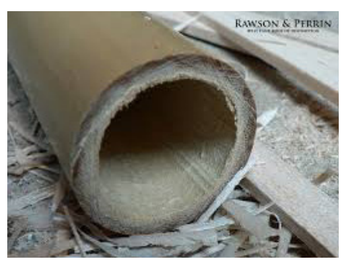
Profile of Tonkin Cane Culm

atically process identical tapered strips that can then be glued together to create a balanced section. Typically, bamboo fly rods come in two, or three sections, depending on the overall length required, including rods in three sections for backpackers, and two section rods meeting other requirements.